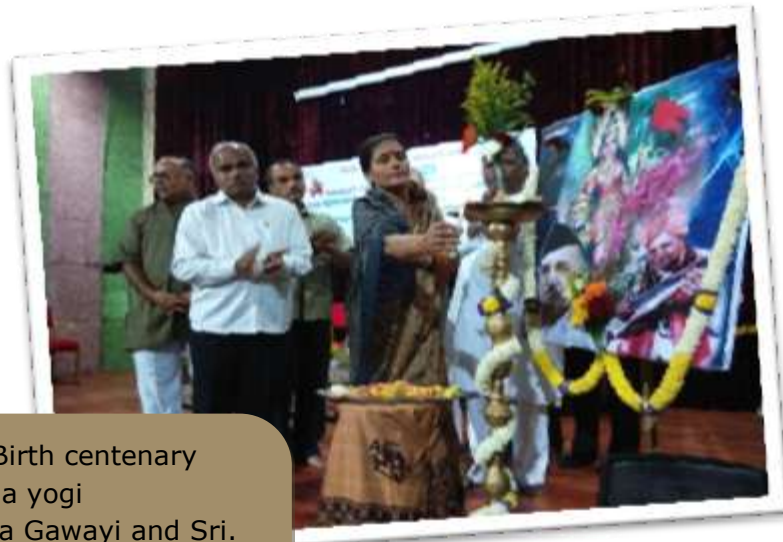
Joint celebration of Birth centenary celebrations of Gaana yogi Sri. Pandith Puttaraja Gawayi and Sri. Yadava Rao Joshi along with World Disable's day by SAKSHAMA Karnataka at Sheshadripuram college auditorium, Bengaluru.