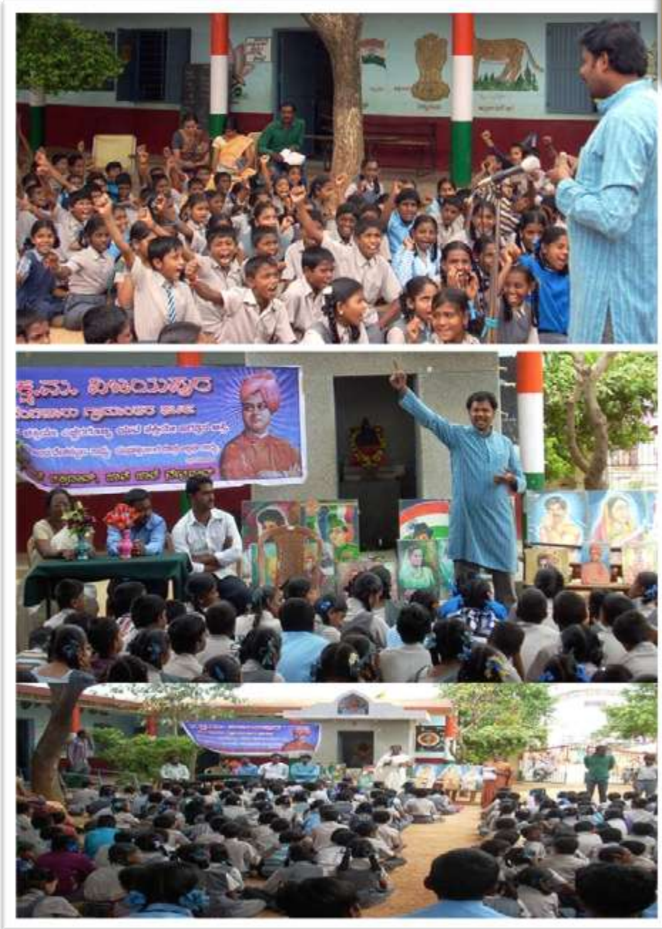
Independence Day celebration at Vijayapura, by SAKSHAMA Bengaluru Rural unit.