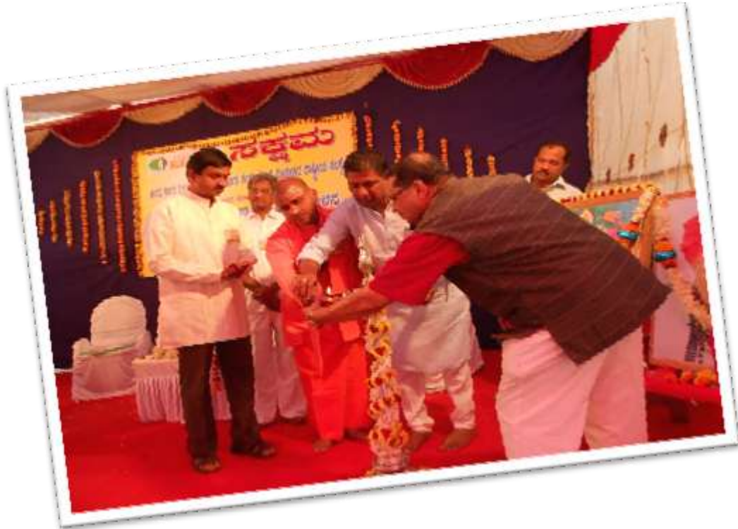
SAKSHAMA Karnataka North Chapter inaugurated on December 7 th at Dharavada.