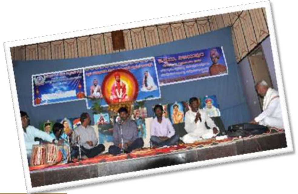
152 nd Birth Anniversary of Swami Vivekananda and Birth centenary of Pandit Puttaraja Gawayi celebrations at Vijayapura, Bengaluru Rural Unit.