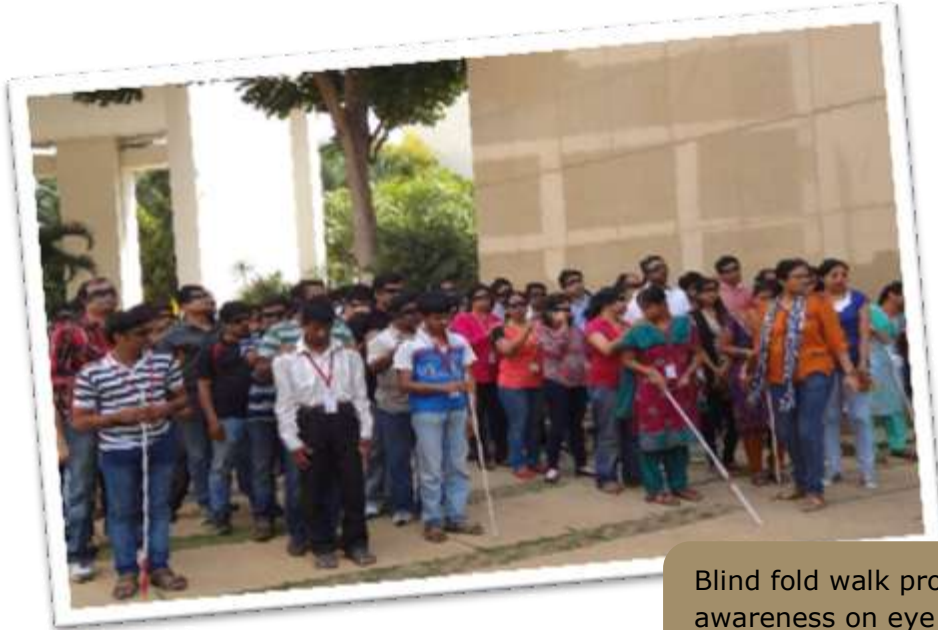
Blind fold walk program to create awareness on eye donation at L&T InfoTech, Whitefield office.