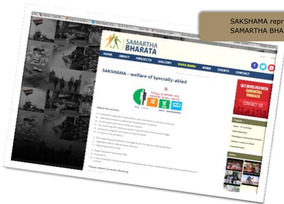
SAKSHAMA represented in SAMARtha BHARATHA event.