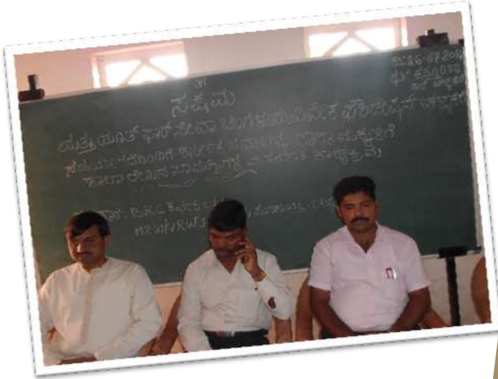
Book Distribution to 200 challenged students at Challakere on 26th July.