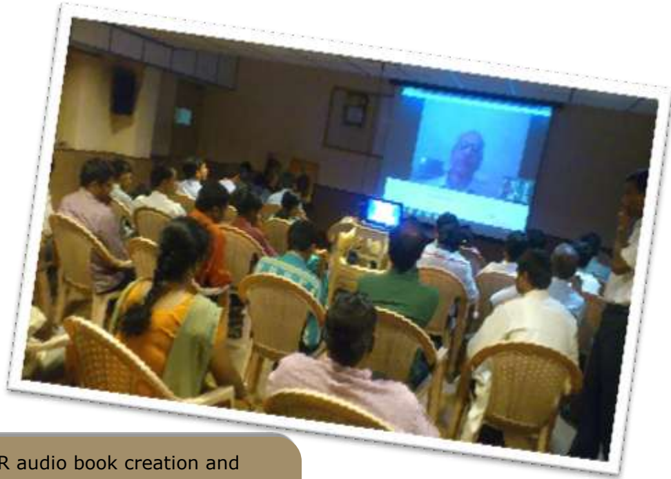
ABRAR audio book creation and compilation technical workshop held at Yadava Smruti, Bengaluru.