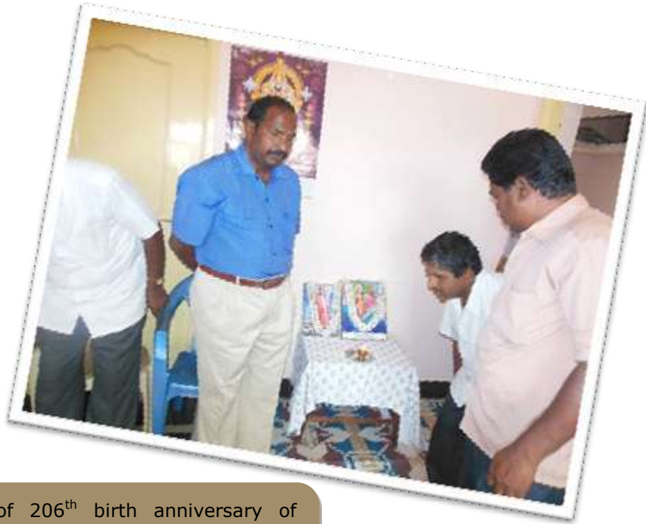
Celebration of 206 th birth anniversary of Louis Braille and Bharat Maatha poojan by Chithradurga SAKSHAMA unit at Challakere.