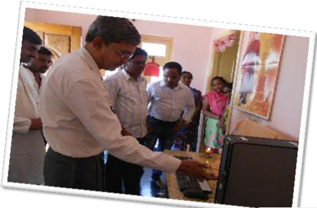
Skill development center inauguration at Challakere.