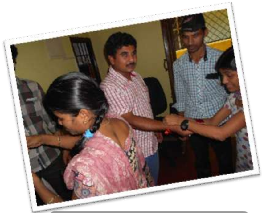
Rakshabhandan celebration at Sahana Charitable Trust, RPC Layout, Bengaluru.