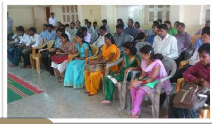
Joint celebration of World Environment day, SAKSHAMA sthapana divas and Helen Keller Jayanti at Yadava Smruti, Bengaluru.