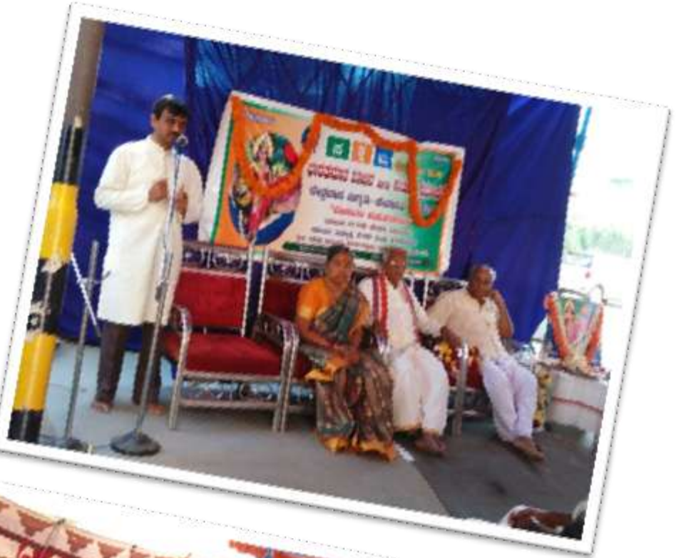
SAKSHAMA Kutumba Prabodhan and eye awareness program at Kumaraswamy layout held on February 1 st 2015.