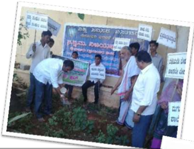
Celebration of World Environment day, SAKSHAMA Sthapana Divas and Helen Keller Jayanti at Vijayapura, Bengaluru Rural.